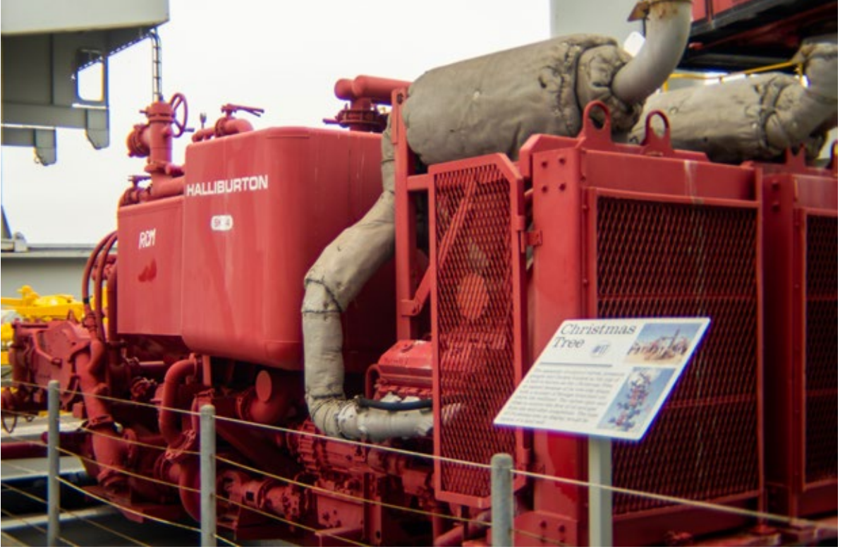
| Photo : Alinoe Roussie, Nautilus Staff Christmas tree presented at Ocean Star museum