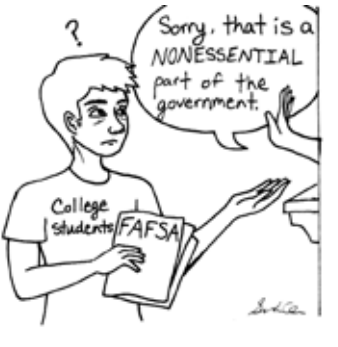
| Illustration: Savannah Quiros, Nautilus Staff

help available for students whose parents have been affected by the government shutdown. Niglio states that TAMU has "created a special installment plan that will delay payment due in full sixty days after the first class day." K.C. clarifies that the special installment plan is for "students with families who are