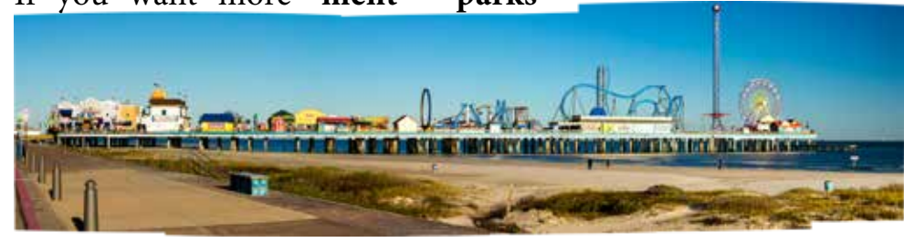
I Photo: Alinoe Roussie, Nautilus Staff

around a little, there are tons of restaurants around the is- Finally, the land where you can