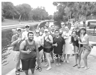
Students at the leadership retreat enjoy tubing down the Guadalupe River.