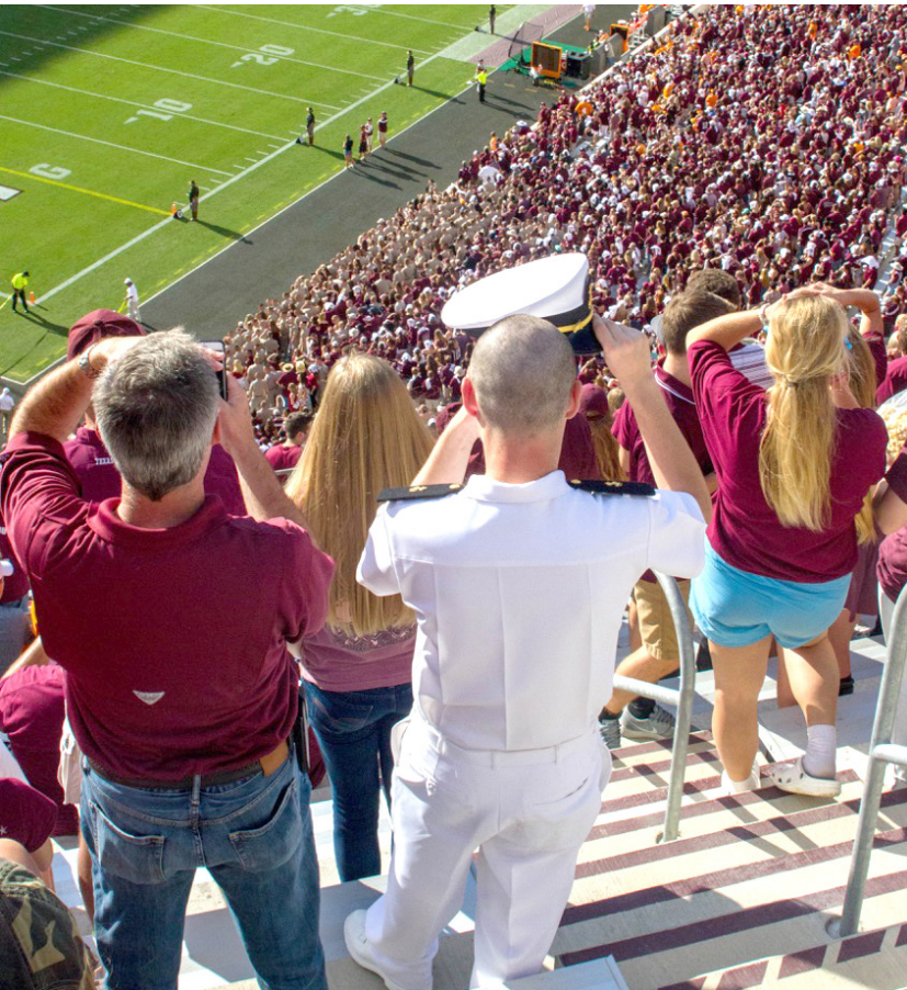
The stadium full of maroon stands as is the 94 year old tradition during Fightin’ Texas Aggie home football games.