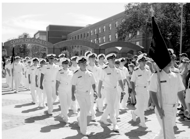
Galveston Corps of Cadets, Bravo 1, marches through the arches outside of the Corps Quad at Texas A&M University.