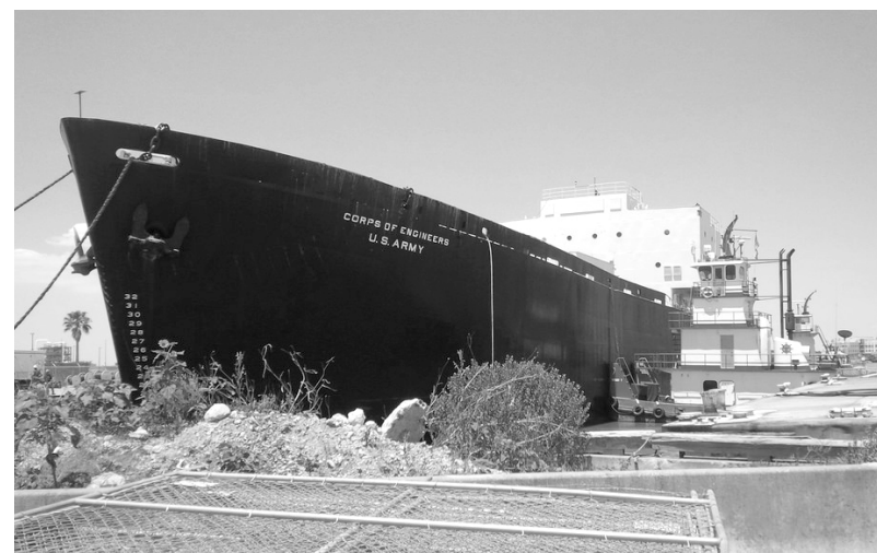
The Sturgis (MH-1A) as it sits in it's berth across the Galveston ship channel from OCSB.

no issues and power was very reliable. Along with a diesel powered barge the Sturgis also allowed the hydro-electric plant that normally supplied power to the canal to cease operations while it's supply reservoir naturally refilled with water. The Sturgis is a testament to how reliable, safe, and flexible nuclear power can be.