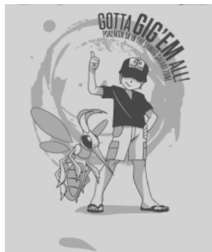
Shirt design by Thea Monnier depicting Mositchu, a TAMUG original Pokemon.