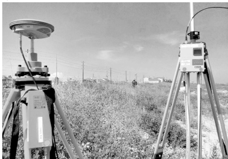
Field methods used in producing 3D models, replications, and predictions for tsunamis.